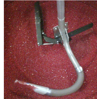
Vacuum pick up