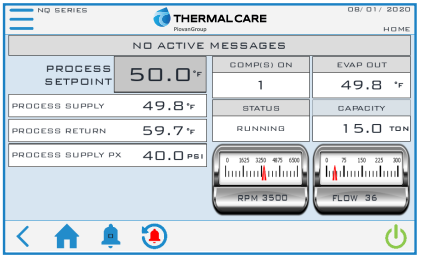
The more advanced NQ Series Premium control option comes with expanded diagnostic and communications capabilities that include: ModBus RTU, ModBus TCP/IP, BACnet MS/TP and BACnet/IP.