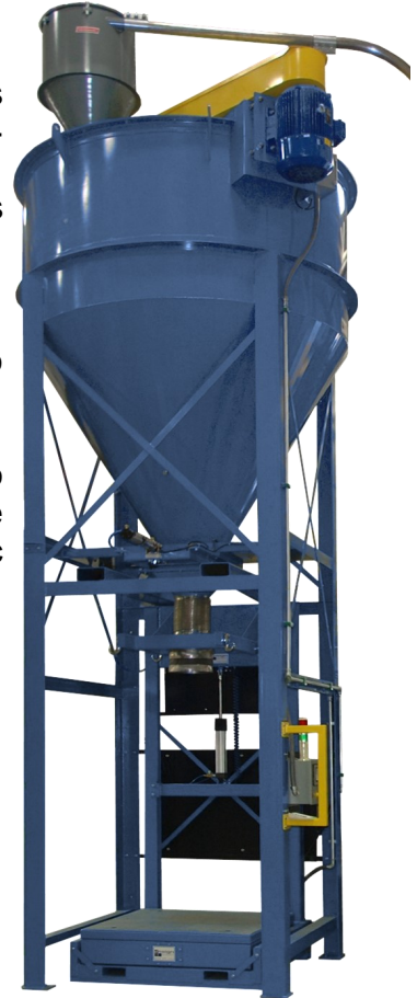
Mixer shown with vacuum loader and integrated bulk bag filling system

See back page for additional options and specifications.